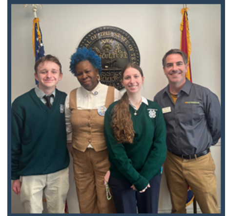
Photo: 4H Congress

As the school year begins to wind down, Davidson County 4-H clubs are wrapping up a busy spring and giving youth the chance to celebrate their accomplishments. More than 200 youth participated in the Poster Art Contest in January, and around 175 shared demonstrations in March, building confidence while teaching others new skills. Fifteen county poster winners are now on display in the office and online, and demonstrators brought creativity and strong presentations to the county contest in April