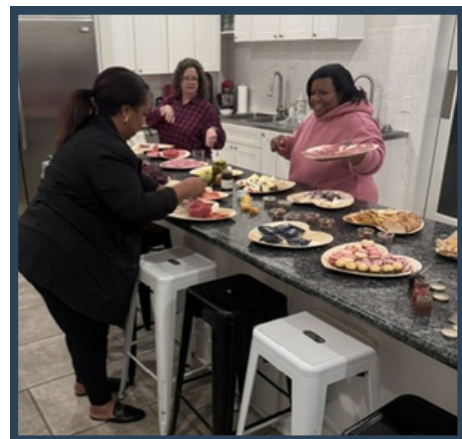
Photo: Boards & Bites Charcuterie Class

Community engagement through EFNEP programming added another layer of impact this quarter. At Napier Elementary's Family Literacy Night, families connected with nutrition education through hands-on activities, including healthy recipe ideas and food samples. Caregivers and youth were introduced to practical resources like "Eating Smart" curriculum materials and take-home recipes, while also connecting with community partners and support services available to them.