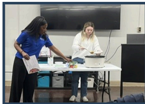
Photo: Dining with Diabetes

Family and Consumer Sciences programming stayed active this quarter, with a strong focus on nutrition, food safety, and overall wellness. In January, an ACES program with Mending Hearts explored how early life experiences impact brain development and long-term health. Dining with Diabetes was offered at multiple locations, reaching participants through hands-on lessons covering topics like carbohydrates, sodium, and disease management, along with recipe tastings and practical tools they can use at home. Nutrition education also extended to youth through a partnership with Woodmont Hills Church of Christ, where participants learned about healthy food choices and prepared simple recipes like smoothies.